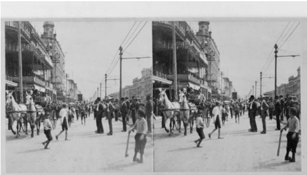
A street in New Orleans filled with people, circa 1901.

As the world awaits the rise of automated vehicles, with their many (if sometimes questionable) promises of improved safety and efficiency, rather than continuing to orient our cities around cars we should be focusing instead on prioritizing transit and active transportation, writes America Walks Executive Director Kate Kraft in response to the recent and worthwhile interactive New York Times column Automated Vehicles Can't Save Cities .