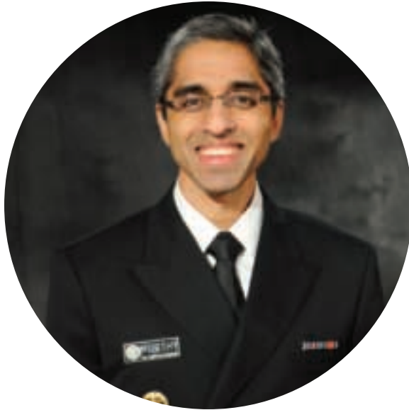
▲ US Surgeon General Vivek K. Murthy's Call to Action on Walking & Walkability encourages everyone to get up and take a walk.