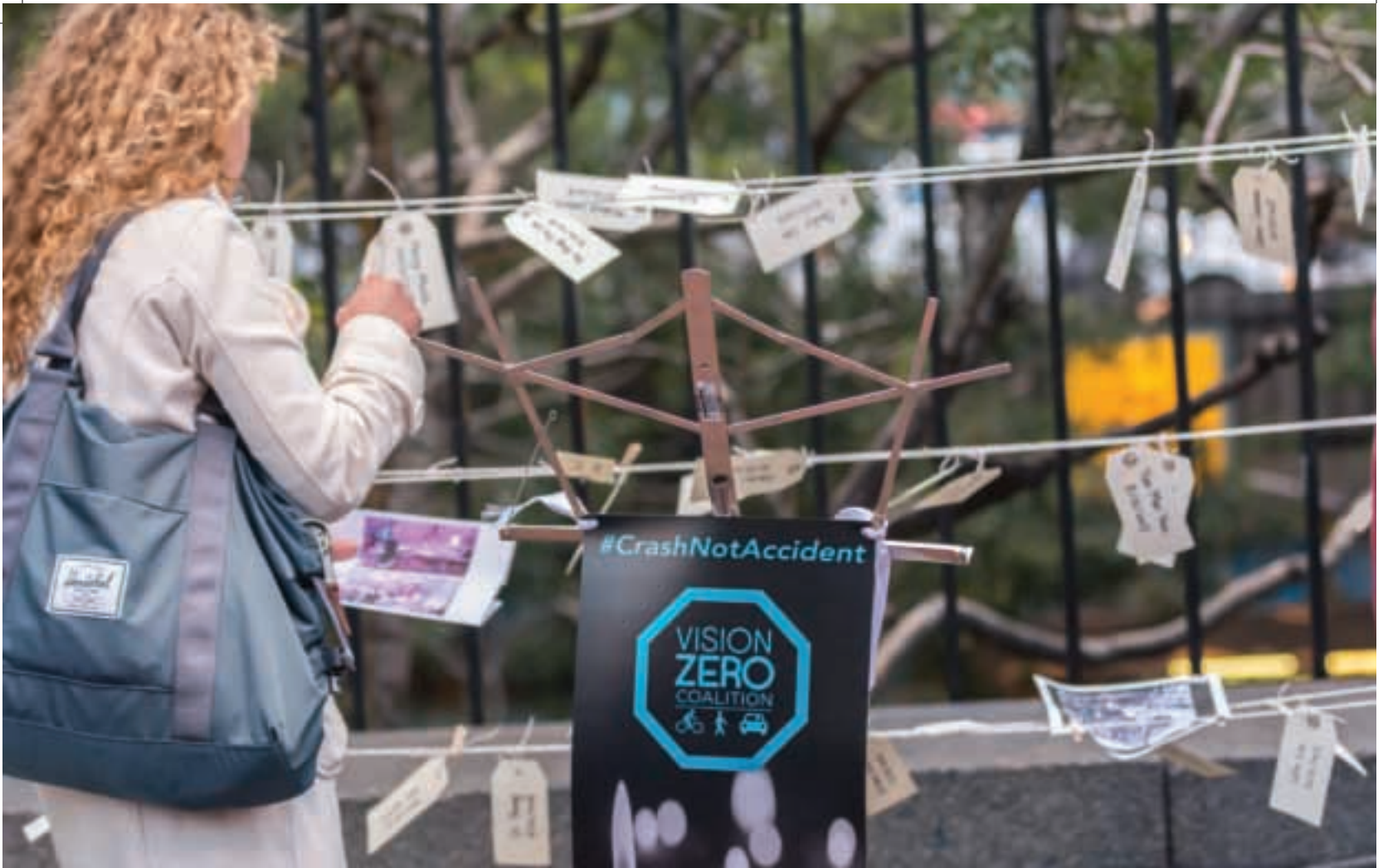
▲ The Vision Zero movement offers proven solutions to stop 4500 pedestrian deaths each year.