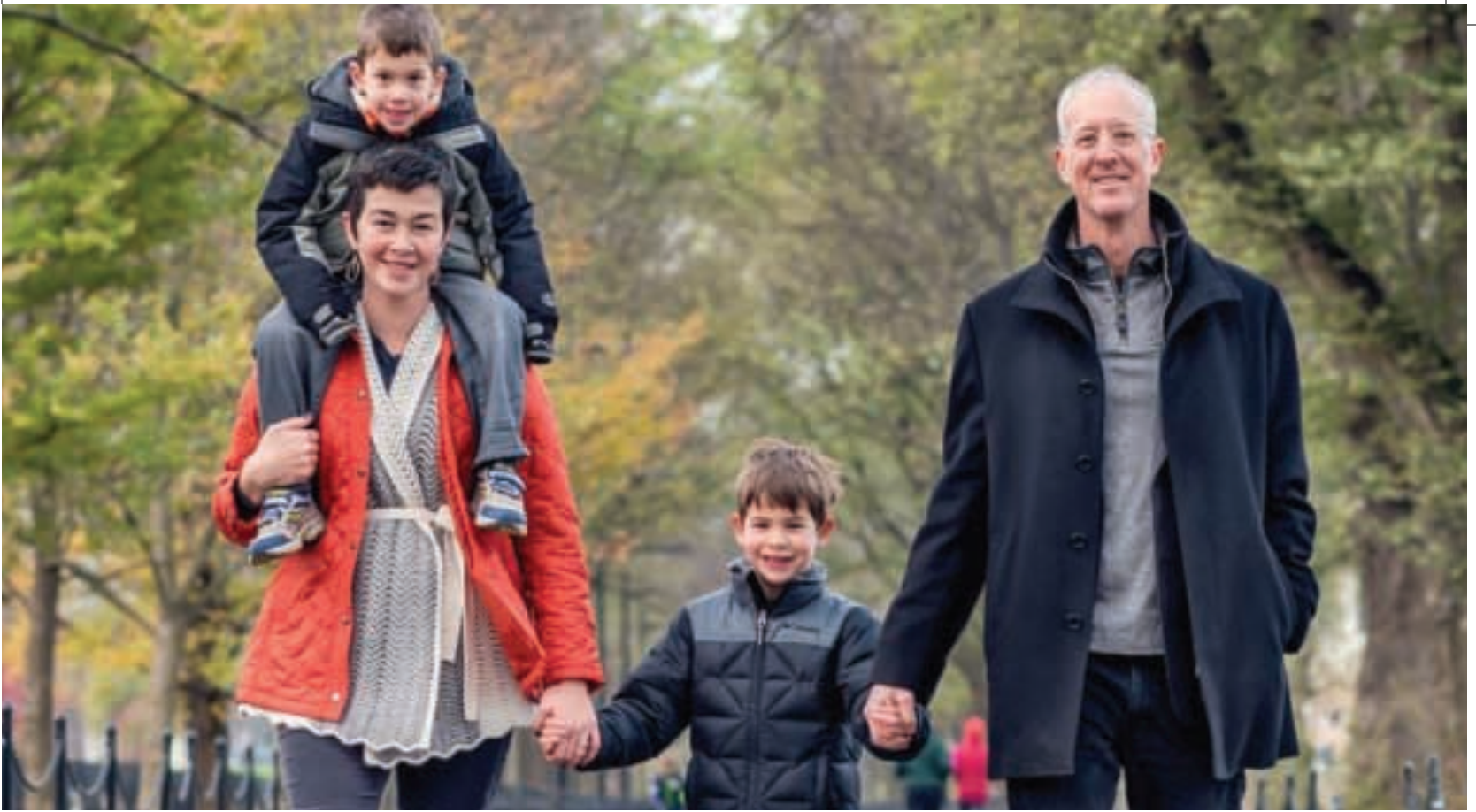
▲ The Speck family lives car-light in the Boston suburb of Brookline, meaning they drive just one car.