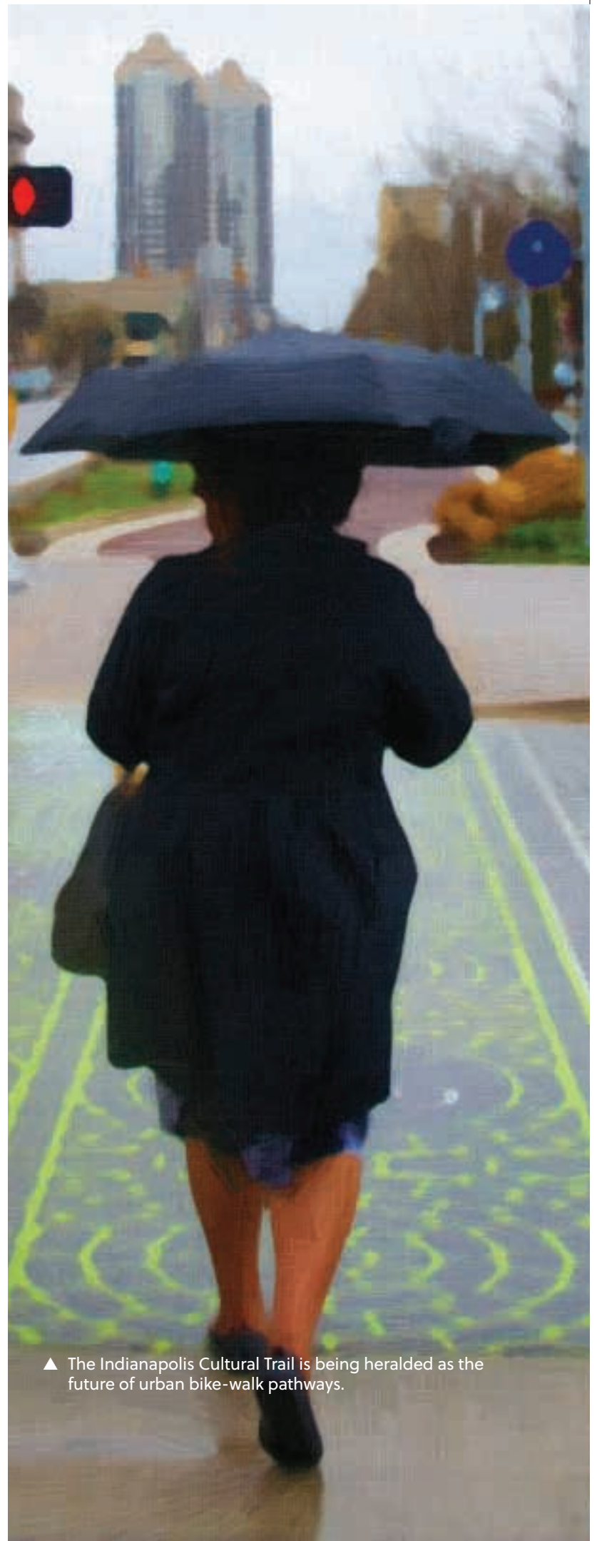
▲ The Indianapolis Cultural Trail is being heralded as the future of urban bike-walk pathways.