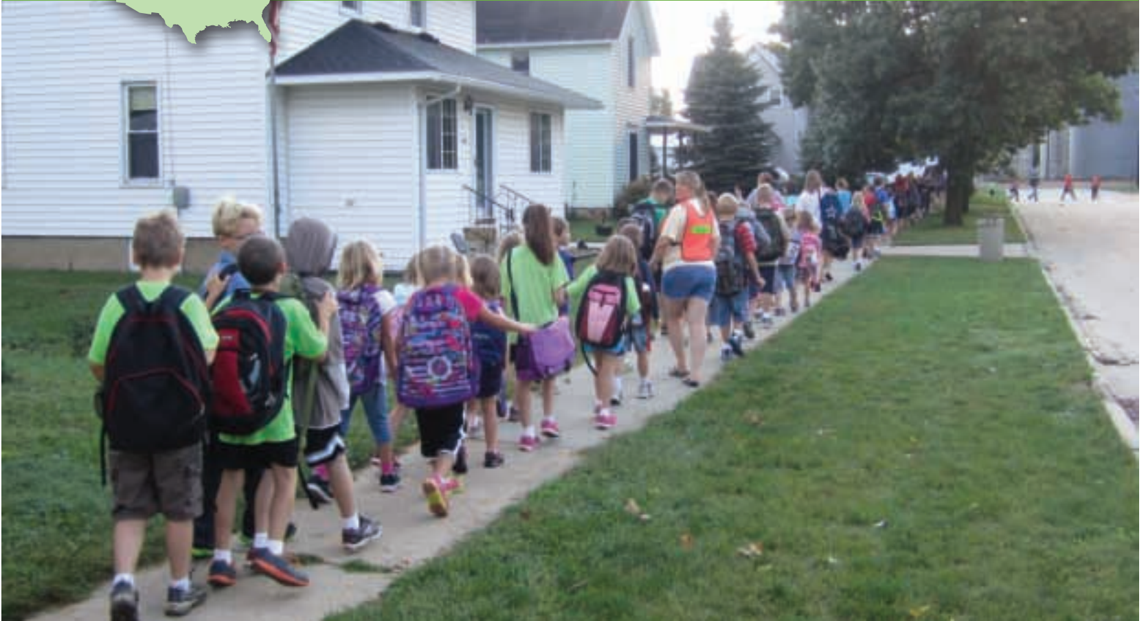
▲ A walking school bus gets kids to classes in Riceville, Iowa.