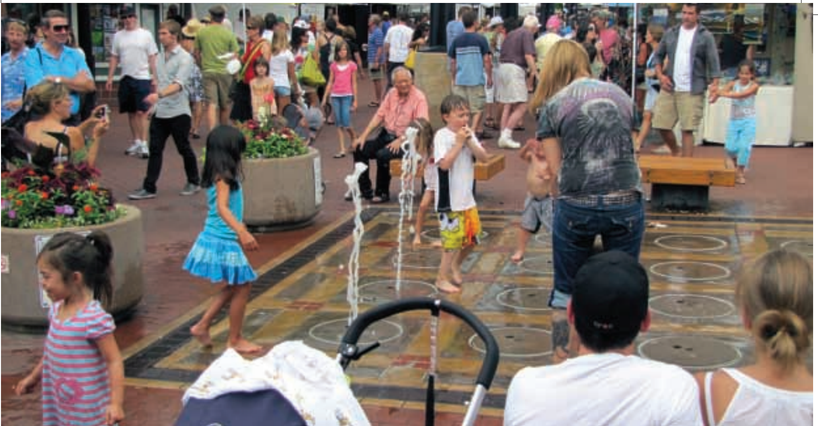
▲ Boulder's Pearl Street Mall is the heart of the community.