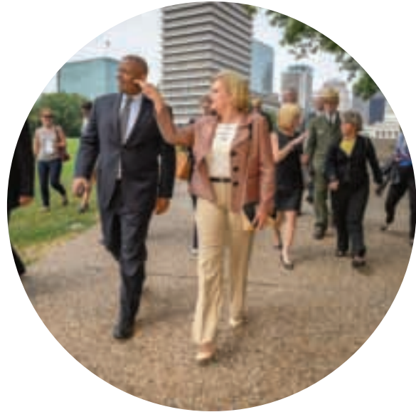
▲ Transportation Sec. Anthony Foxx (left) walks with Missouri Sen. Claire McCaskill to an event celebrating pedestrian improvements at the St. Louis Arch.