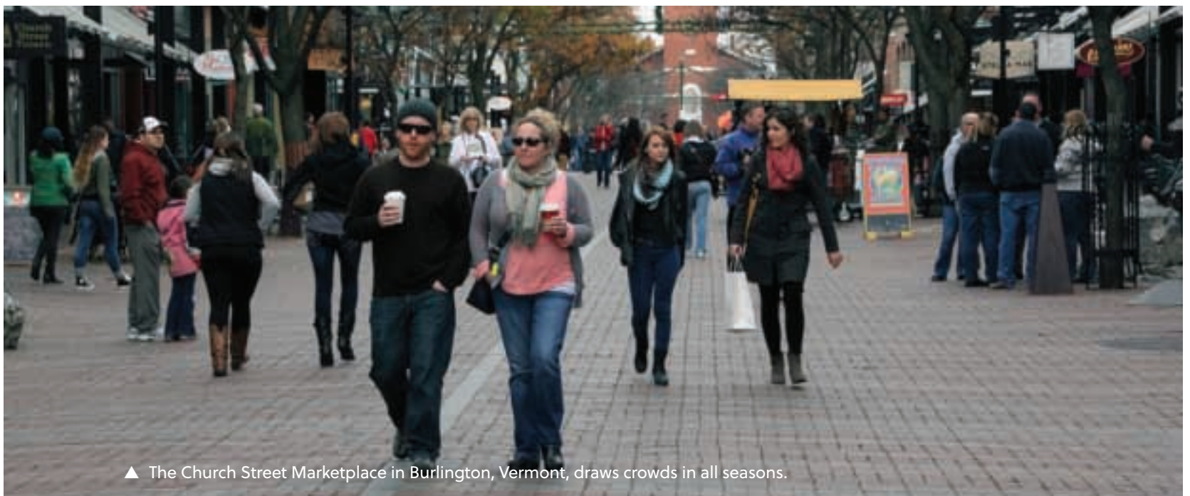
▲ The Church Street Marketplace in Burlington, Vermont, draws crowds in all seasons.