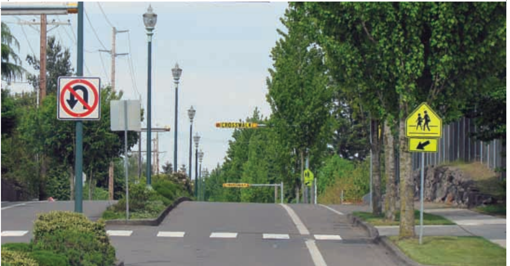
▲ University Place, a Seattle suburb, excels in making streets that cater to people on foot as well as cars.