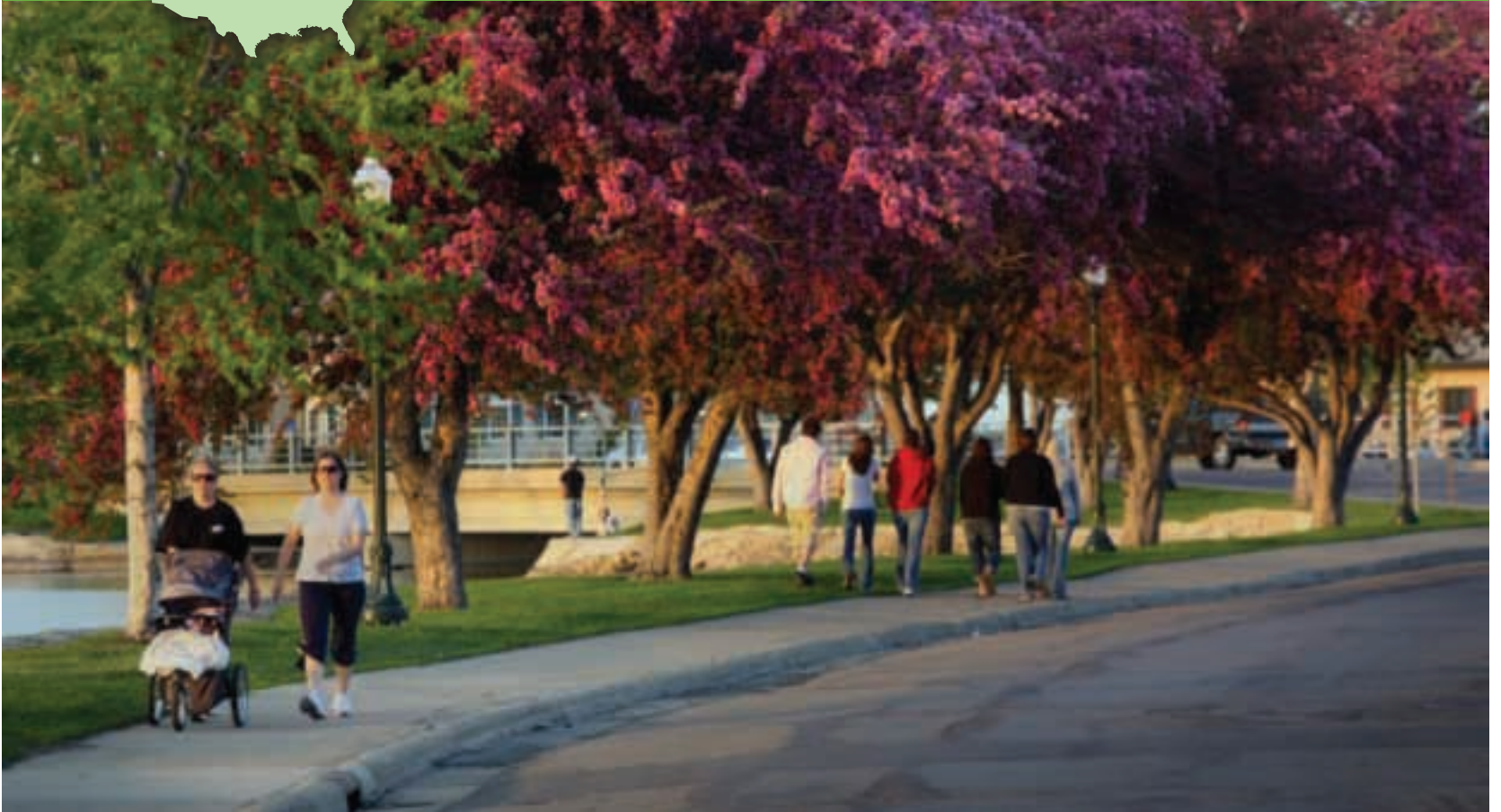
▲ The 5-mile Blue Zones Walkway around Fountain Lake Park brings out people all year round.