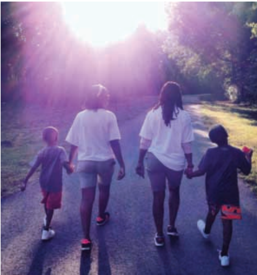
◀ The Enon Ridge Trail is one of the first links in a countywide greenway network.

Birmingham has many strong and committed people working to reframe, redesign and reenergize their community by partnering with many different types of organizations with complementary visions. Lakeshore Foundation is one of these groups, which wants to make sure that their members with disabilities and injured military veterans can benefit from the new trails by advocating for universal design and participating in these community initiatives.