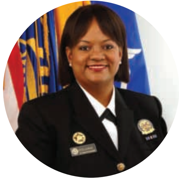
▲ Former Surgeon General Regina Benjamin built a walking path at her Alabama clinic to increase social interaction in the community.