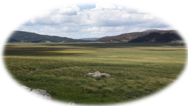
Valles Caldera National Preserve, New Mexico – Image from NPS website.